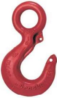
S-320 EYE HOOK