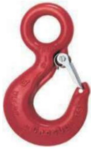
S-320N EYE HOOK